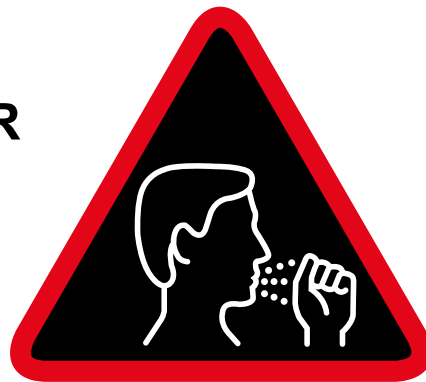
NEW CONTINUOUS COUGH