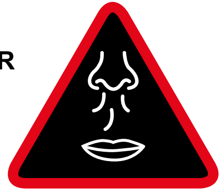
LOSS OF TASTE OR SMELL